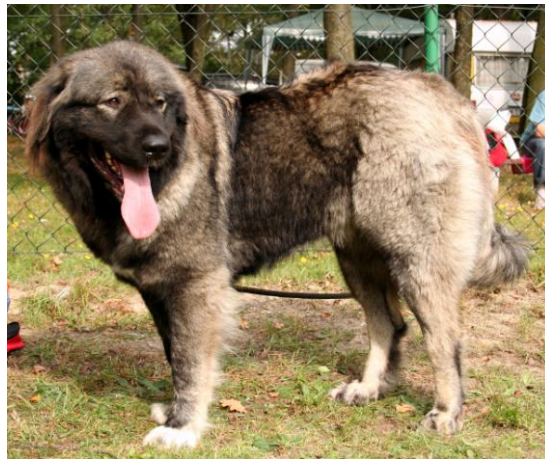
FIGURE 1. Caucasian Shepherd Dog 8

The former group includes a plethora of forms, all following the pattern karBUra- , where B stands for b , p or v ; U – for a , u or ū . These are karbura- “variegated, of a spotted or variegated color” 6 (Cl. Skt.); “sin”; name of a Rakṣas; “curcuma” or “Zingiber zerumbet” (all – L.) (also karbu- (Yājñavalkya-Smṛti 3.166) “variegated, spotted”, probably the truncated form of the preceding); karbara- / karvara- “sin”; tiger; “hing spice, Asafoetida” (extracted from rhizome or tap root of Ferula , also known as “devil’s dung” in several languages; of dark amber color when dried) or the leaf of this plant (?); name of a Rakṣas; karbūra- name of a Rakṣas; “curcuma”; a kind of venomous (speckled) leech; “gold”; a yellow orpiment (all – L.), etc. The only Vedic form in this quite large group is kārvara- (homonymous with Vedic kārvara- “deed”, attested a few times in the RV and AV), which occurs once at AVŚ 10.4.19, in a context where it must refer to a certain speckled (? thus Mayrhofer, EWAia I:318) species of fish. 7