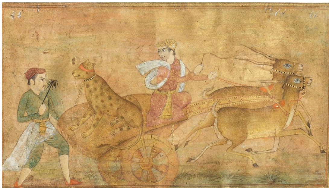
FIGURE 2. A prince in a chariot with a hunting cheetah, with an attendant running behind, by an unknown Persian (Moghul) artist. 10

This hypothetical Wanderwort could originate in a proto-form from a non-Indo-European language (or a group of historically related proto-forms in a few genetically related languages). I argued that a good candidate may be the Proto-North-Caucasian form reconstructed as *čərbV ( /*bərčV (~ č )) (NCED 341), denoting a breed of dog, 9 perhaps close to what we know today as the Caucasian Shepherd Dog (Fig. 1).