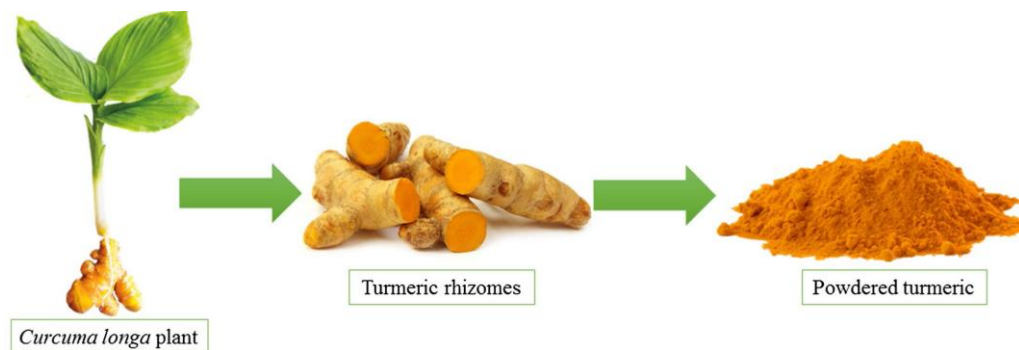
FIGURE 6. Curcuma rhizome, sections and powder (after Abdel-Hafez et al. 2021, fig. 1)

only to the substance (essence) proper, but also to the plant from which it is obtained 15 , i.e. camphor tree (also known as camphor laurel or Cinnamomum camphora ). This plant, which at first glance has nothing to do with the spotted dogs or cheetahs, has an interesting peculiarity: its new leaves start out a rusty red, but soon turn dark green. This gives to the tree a remarkable, even unique, motley or speckled color pattern, which, in addition, may appear brownish (← red + green) and, to some extent, even resemble the spotted brownish pattern of cheetah's skin. Both formal and semantic similarity 16 could eventually have triggered the secondary re-etymologization of this word as a “cheetah-colored tree” (?) and, subsequently, the emergence of the secondary medial -r , thus giving rise to the actually attested form karpūra- .