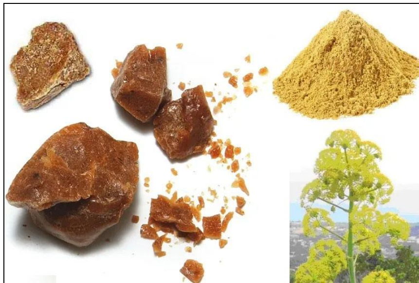
FIGURE 5. Hing spice (Asafoetida) and Ferula plant 14

This may give a clue to the explanation of the Old Indo-Aryan word for camphor, karpūra- , as opposed to its Iranian (and other) cognates. It seems that the form karpūra- (← *kapūra- ?) could be modified under the influence of other members of the karBUra- family, not only due to their formal similarity but, presumably, due to somewhat vague, yet not neglectable, semantic parallelism. The word under study may refer, presumably, not